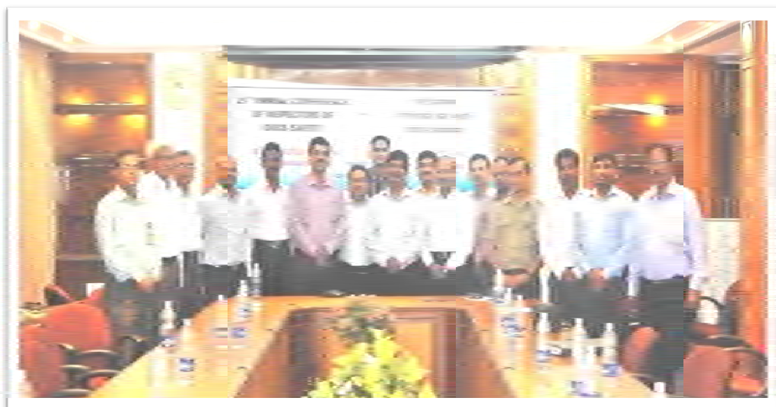
Participants of 29 th Conference of Dock Safety Inspectors held on 10 th -11 th September, 2014 at J. N. Port, Navi Mumbai