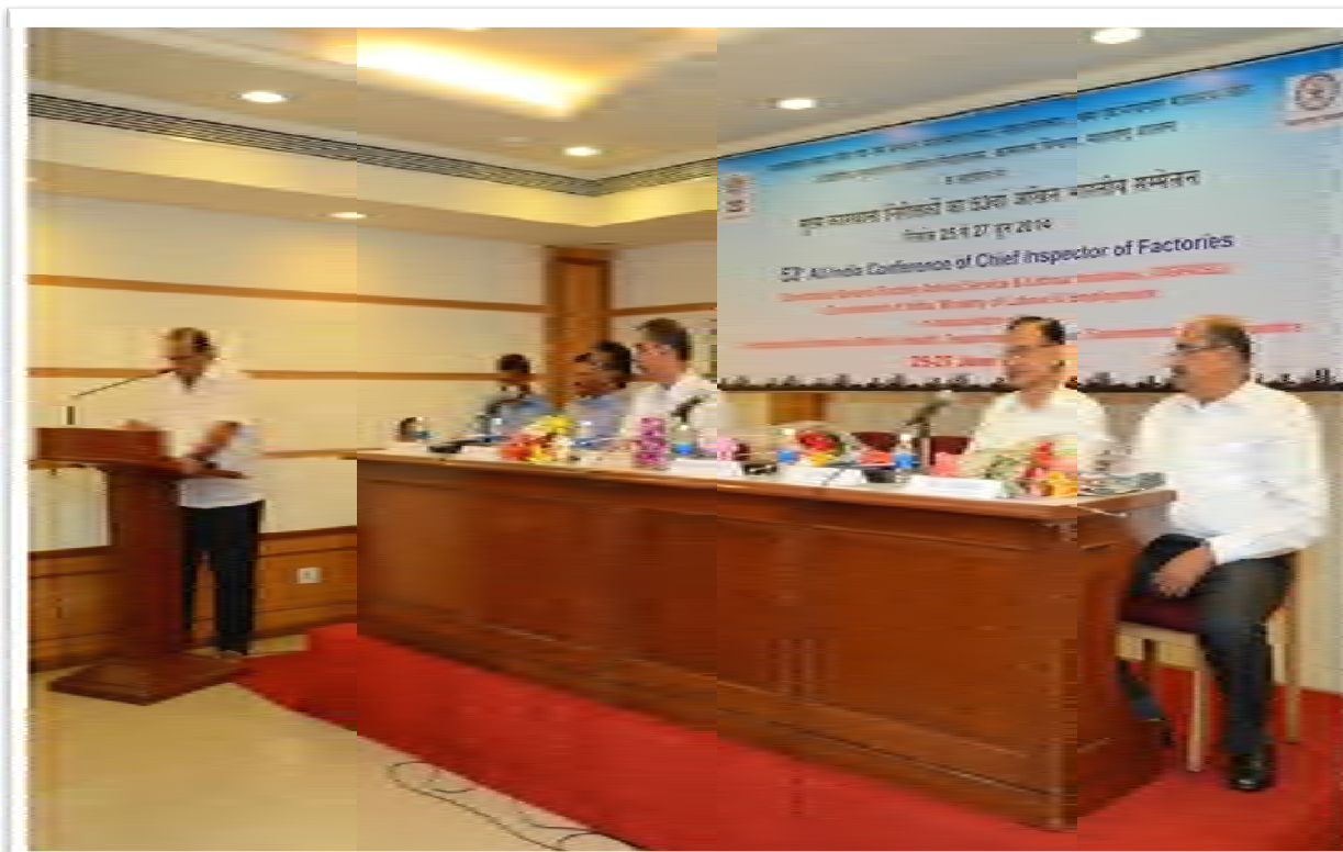
Shri Hasan Mushrif, the Hon'ble Minister for Labour and Special Assistance, Govt. of Maharashtra delivering special address in the 53 rd CIF Conference

Shri Hasan Mushrif, the Hon'ble Minister for Labour and Special Assistance, Govt. of Maharashtra in his address expressed his happiness that the Conference is being organized in Mumbai, Maharashtra which is a leading industrial city in India. In his address he also stressed upon the importance of enforcing the Factories Act, 1948. He urged upon all the Chief Inspectors of Factories present to enforce safety measures and methodologies so that accidents in the factories are considerably brought down.