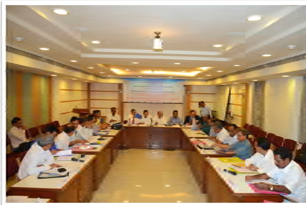
Director General, DGFASLI and delegates from various states participating in the deliberations in the 53 rd CIF Conference