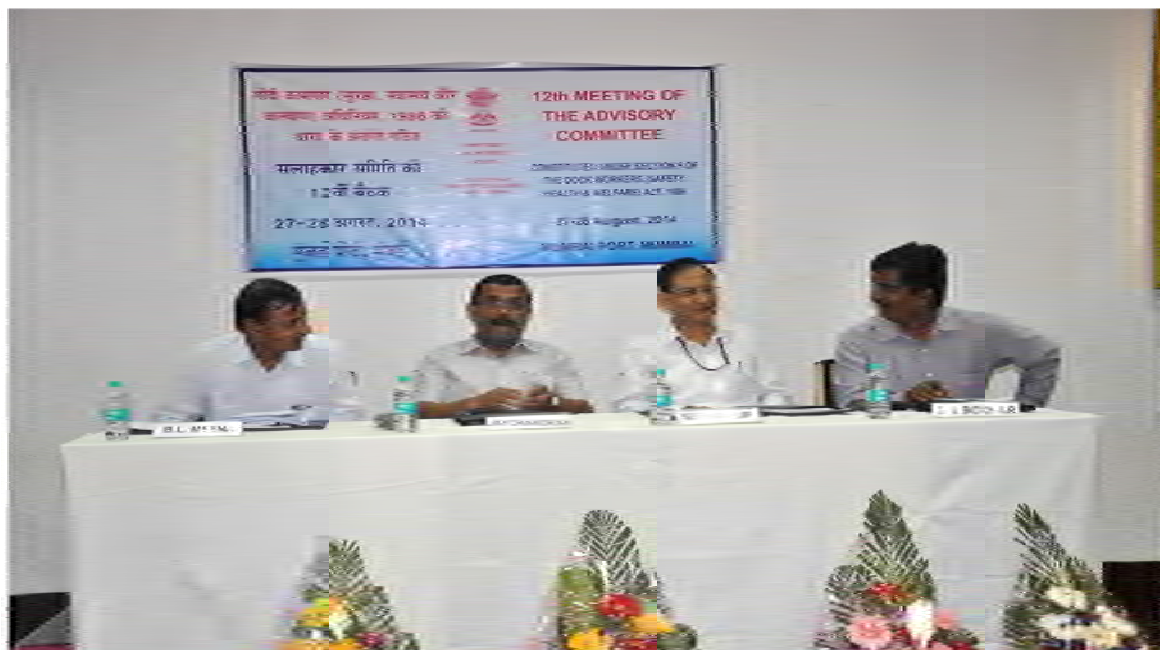
Dignitaries sitting on dais during 12th advisory committee held on 27th-28th August, 2014 at Mumbai Port